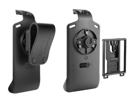
LEX L11 HOLSTER WITH AUDIO ROUTING TECHNOLOGY